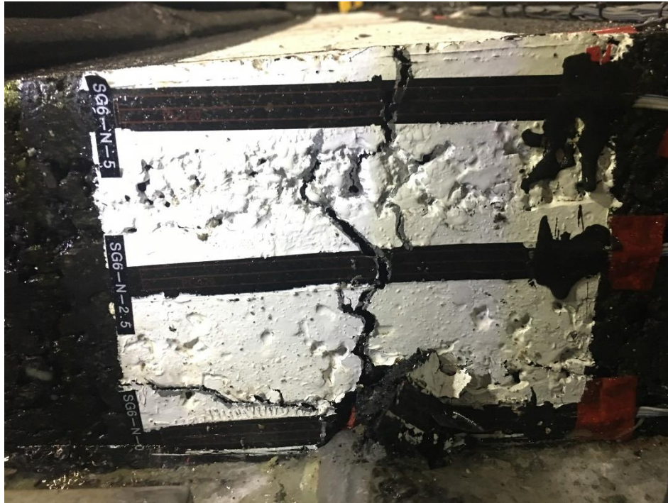
Fig 2 Bottom-up crack north outer edge reached top surface