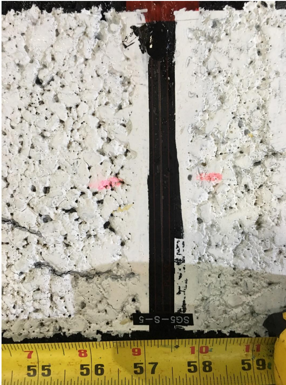
Fig 8 South section surface crack 3 inches from the outer vertical edge