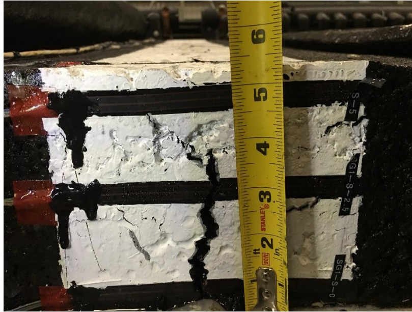
Fig 5 Bottom-up crack at SG1-S-0 4.5 inch long