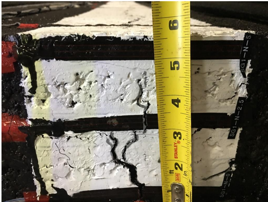
Fig 1 Bottom-up crack at SG1-N-0 and SG1-N-2.5 4.5 inch long