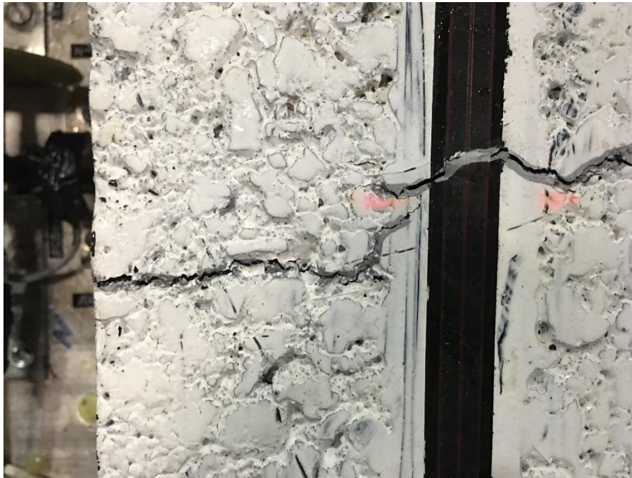
Fig 3 Surface crack on North Section reached outer edge