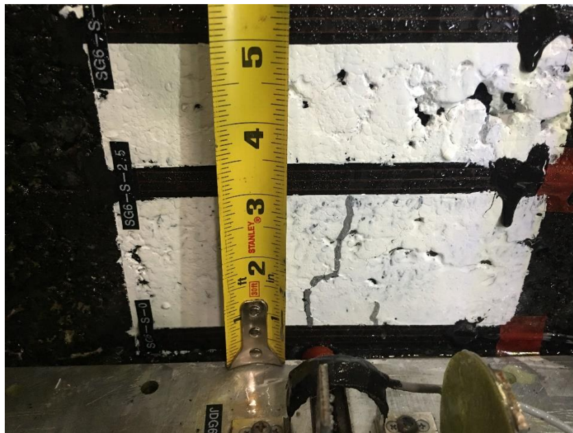
Fig 6 Bottom-up crack at SG6-S-0 3 inch long