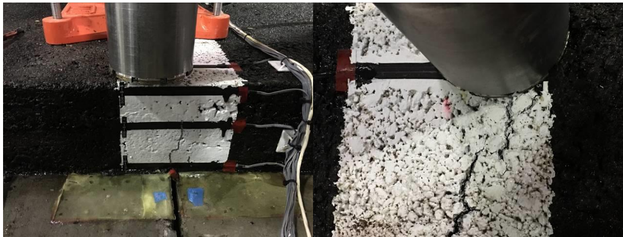
Figure 9 Overlay core taken at the outer edge of south section

The RC Indoor Phase VI test was completed today (Aug 05, 2019). At 2:00PM, one overlay core was taken at the outer edge of the south section as shown in the following Figs. At 3:00PM, the chiller, rig and the DAQ were shut off.