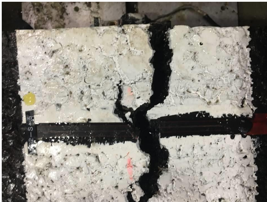
Fig 7 South section surface crack reached the inner vertical edge