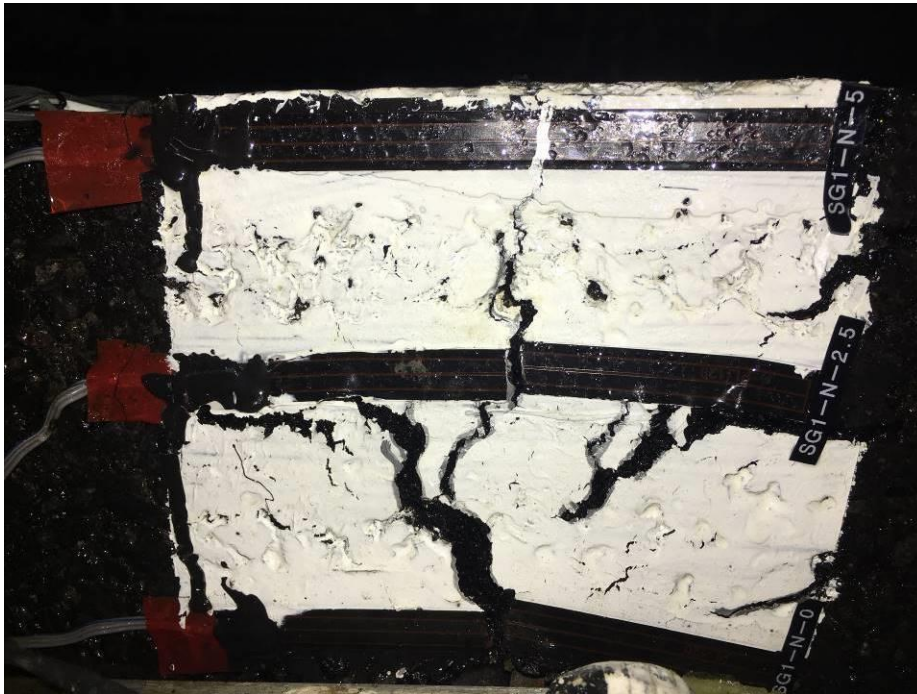
Fig 1 Bottom-up crack at north section inner vertical edge reached top surface