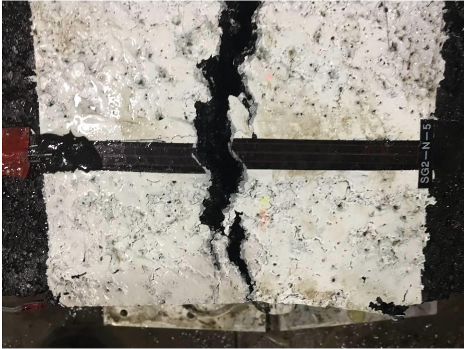
Fig 4 North section surface crack reached inner vertical edge