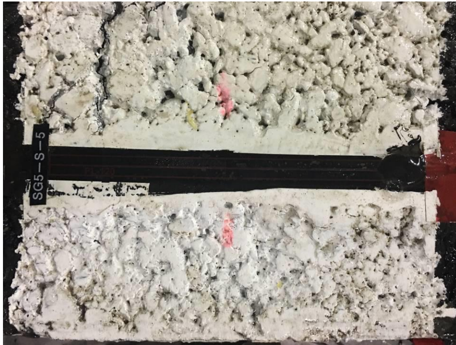
Fig 8 South section surface crack 3 inches from the outer vertical edge

The RC Indoor Phase VI test was completed today (Aug 05, 2019). At 2:00PM, one overlay core was taken at the outer edge of the south section as shown in the following Figs. At 3:00PM, the chiller, rig and the DAQ were shut off.