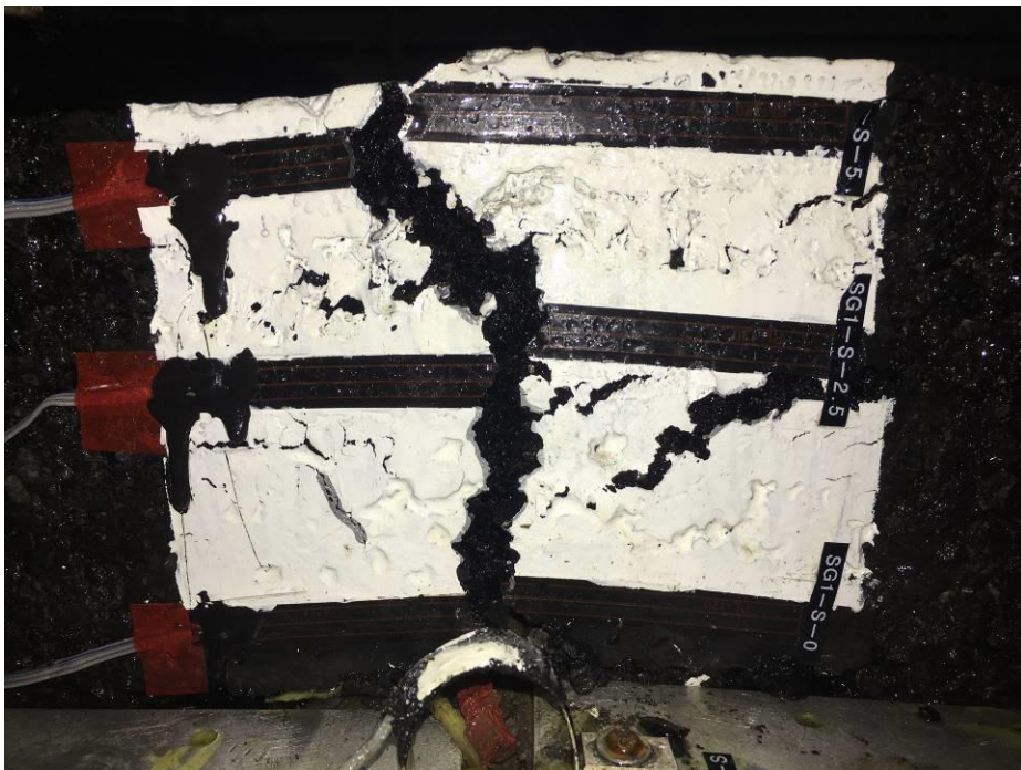
Fig 5 Bottom-up crack at inner vertical edge of south section reached top surface