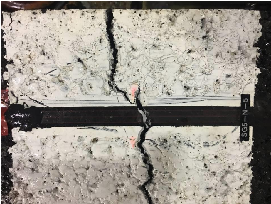
Fig 3 Surface crack on North Section reached outer edge