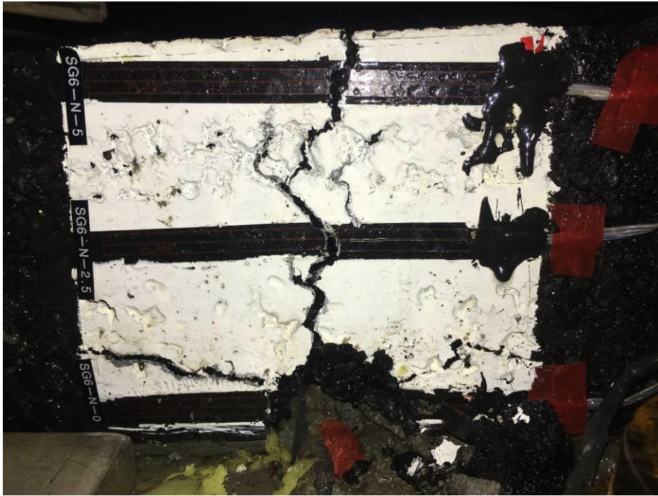
Fig 2 Bottom-up crack at north section outer edge reached top surface