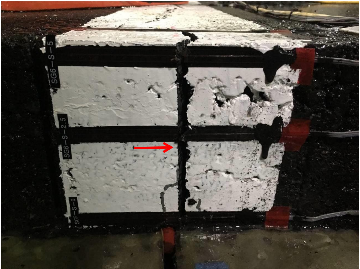
Figure 11 Overlay core taken at the bottom up crack