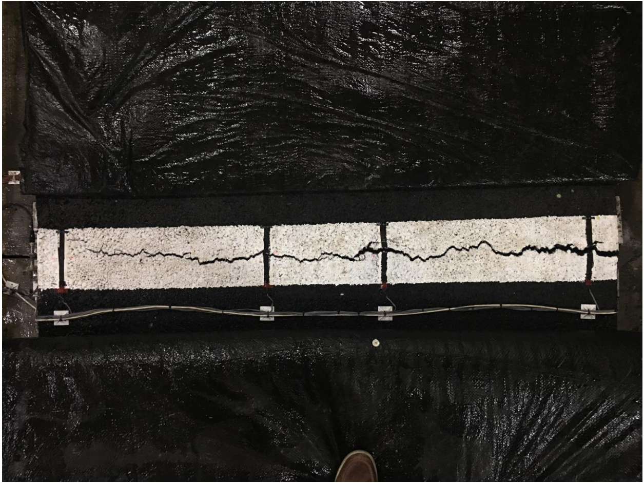
Fig 8 South Section Surface Crack