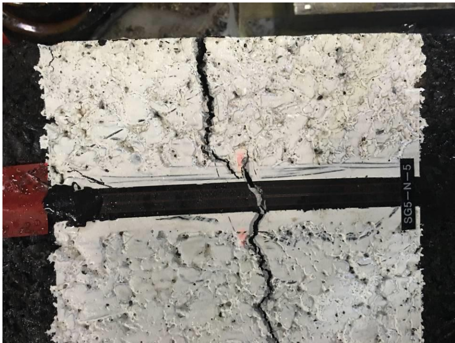
Fig 3 Surface crack on North Section reached outer edge