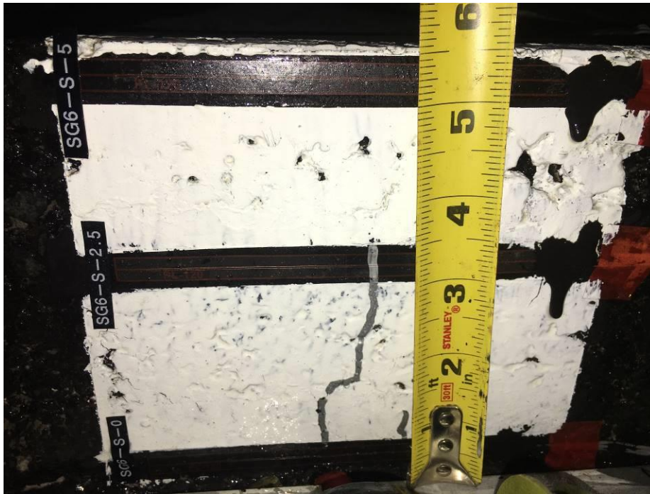
Fig 6 Bottom-up crack at SG6-S-0, SG6-S-2.5 approximately 3.5 inch long