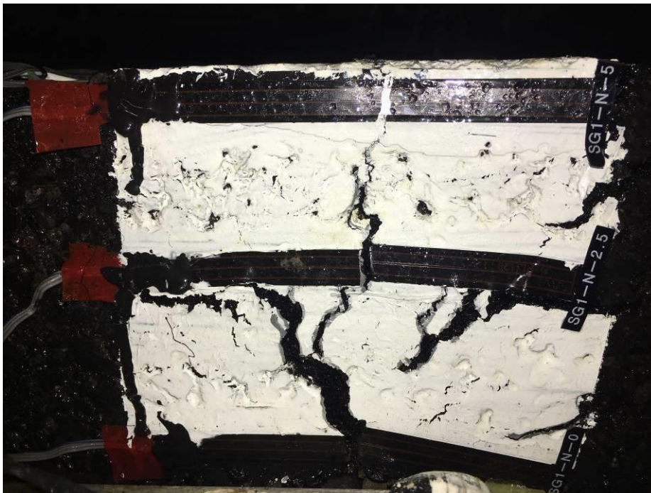
Fig 1 Bottom-up crack at north section inner vertical edge reached top surface