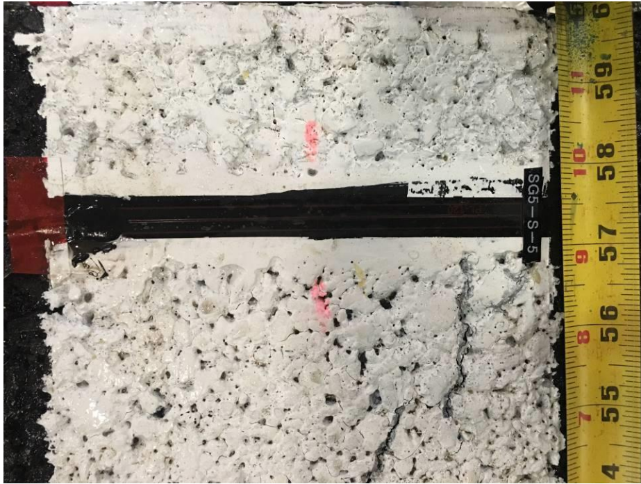
Fig 8 South section surface crack 3 inches from the outer vertical edge